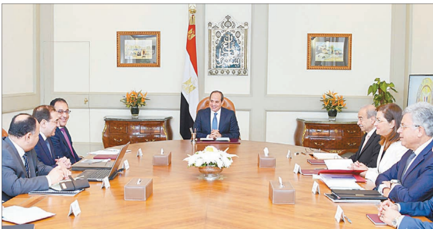
PRESIDENT Abdel Fattah El Sisi during his meeting yesterday with Prime Minister Dr Moustafa Madbouli, the Assistant to the President for National and Strategic Projects, Sherif Ismail, Petroleum Minister Tarek el-Mulla, Planning Minister Dr Hala el-Saeed, Finance Minister Mohamed Maeet and the head of the Administrative Control Authority, Mohamed Erfan.

President Sisi also called for the adoption of whichever measures deemed necessary for ensuring the availability of such an atmosphere that would be conducive to the attraction of more investments in search and exploration activities, thereby contributing to the expansion of oil