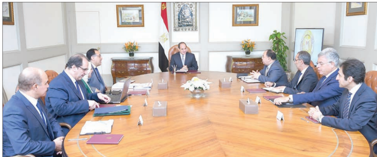
PRESIDENT Abdel Fattah El Sisi during his meeting yesterday with Prime Minister Dr Moustafa Madbouli, Finance Minister Mohamed Maet, Health Minister Hala Zayed, Communications and Information Technology Minister Omar Talaat, General Intelligence Chief Abbas Kamel and Administrative Control Authority Chairman Mohamed Erfan.