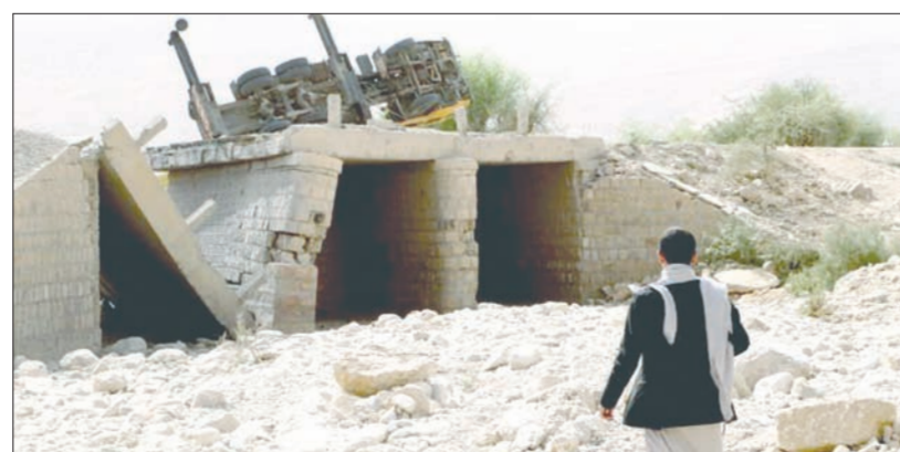
A MAN inspecting damage of an airstrike on a truck in the northwestern city of Saada yesterday.

The Houthis have controlled the port since 2014, when they drove the