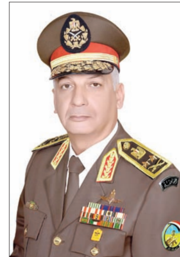
Gen Mohamed Zaki

Minister Tawfik then asserted the necessity of maintaining preparedness and alertness at all security sites and services as well as the importance of leaving no hole open for terrorist activity given that foreign support for extremist and anti-state groups continues to flow. The minister also stressed the importance of adopting modern and up-to-date techniques in identifying the perpetrators of criminal law-breaking and political crimes.