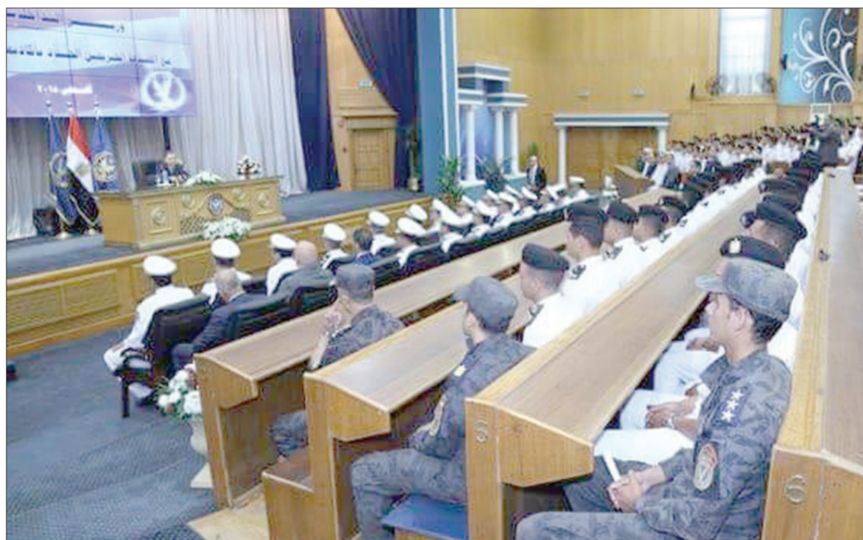
THE Minister of Interior, Gen Mahmoud Tawfik, speaking yesterday to a batch of new officers who joined the police service.

Noting that security is one of the necessary components for the building and progress of the society, Minister Tawfik emphasised that Police and Armed Forces personnel are the security valve and that the